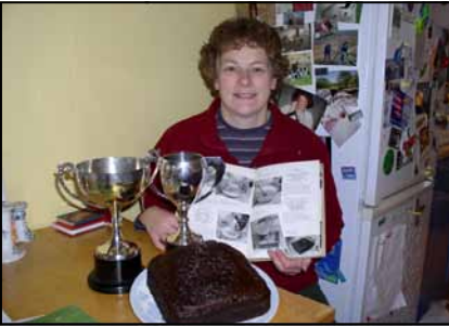
Lucy with her silverware

Prepare an 8ö square cake tin (greased and lined with baking parchment) Set the oven at Reg 3 or 160° C (slightly lower in a fan assisted oven)