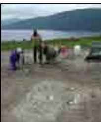
Protecting the heart

Until a few years ago, I had always known this heart (made from white stones) to be called the ōTinkers Heartō but it was brought to my notice, that a local family had been married there in 1872. Relatives of the couple, said that at that time it was quite common for couples to be married at the ōHeartō , as it was a central meeting point.